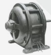
1910 Five-horsepower induction motor, Hitachi's first product