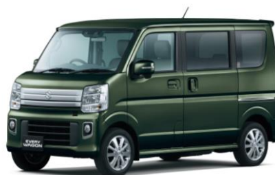
EVERY WAGON PZ Turbo Special with stereo camera mounted