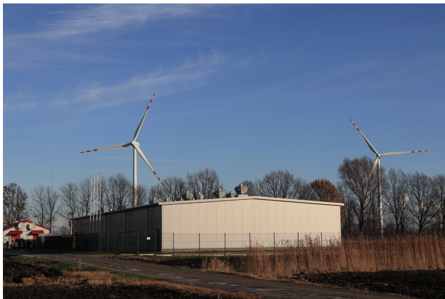
Figure 1. The hybrid BESS building installed next to the Bystra Wind Farm