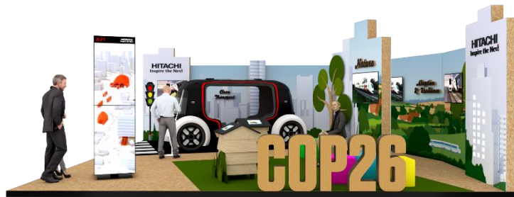
The Hitachi Group's Booth at the COP26 Green Zone

Through seminars and exhibits, Hitachi will introduce to the world activities and advanced technologies that support the realisation of a decarbonised society