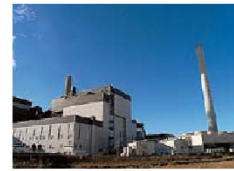
Coal-fired power plants*