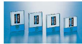
Prismatic lithium ion rechargeable batteries featuring thin type and high capacity by Hitachi Maxell, Ltd.