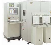
Hitachi High-Technologies' "CG4000" CD-SEM for 45nm / 32nm generation and beyond