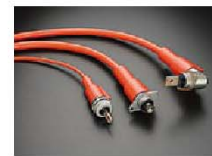
Hitachi Cable's HEV power harnesses