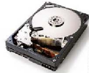
1-terabyte 3.5-inch hard disk drive by Hitachi Global Storage Technologies