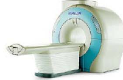
Hitachi Medical's high magnetic field MRI system "Echelon Vega"