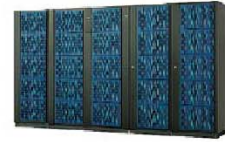
Large disk array subsystem*