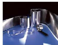
Hitachi Metals' amorphous alloys for transformers