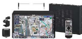
Clarion's car navigation system